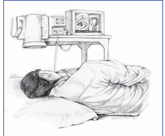
During colonoscopy, patients lie on their left side on an examination table.

During colonoscopy, patients lie on their left side on an examination table. In most cases, a light sedative, and possibly pain medication, helps keep patients relaxed. Deeper sedation may be required in some cases. The doctor and medical staff monitor vital signs and attempt to make patients as comfortable as possible.