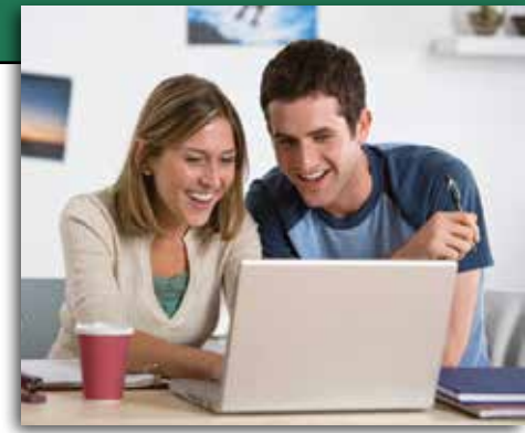
All clinic patients can now register for a Patient Portal account and have 24/7 access to their medical information.