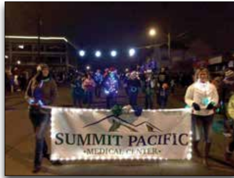
A group of staff and their families gathered together this year to represent Summit Pacific Medical Center in this year's annual Montesano Festival of Lights.

For the 2nd year in a row, the staff at Summit Pacific Medical Center challenged each other to see who could "raise" the most food and/or winter clothing donations through their annual "Food Bowl" that takes place through the months of November and December. This year, thanks to many donations, staff was able to collect and donate 600 food items, 10 winter clothing items, and $30 cash. All the donations were loaded up and dropped off to both the McCleary and the Elma Food Banks.