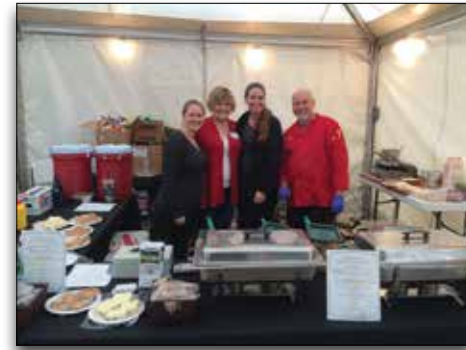
SPMC staff volunteered at Elma's Winter Wine Festival to raise money for Summit Pacific Medical Foundation.

All involved enjoyed having the opportunity to wrap each other up in blue, green and white lights. All together there were about 25 people passing out fruit snacks behind the Summit Pacific banner. Staff who participated earned points on their Peak Performance Trail Pass Card. The Peak Performance card is part of a new staff wellness program Summit Pacific put in place to encourage and assist staff in making healthy lifestyle changes. Each month there are different challenges and opportunities for staff to earn points which they can cash out for fun rewards.