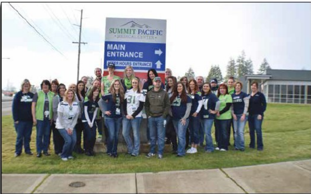
Some of the donors gathered for a group photo.

More than 70 employees of the hospital district donated to Summit Pacific Medical Foundation's Patient Assistance Fund for "Go Casual Day," on Friday, January 8, and then thanks to a Seahawks win, again on January 15. In return for donating, employees were able to wear jeans and Seahawk gear to work. The donations to this fund help provide necessary medications and medical supplies to those who cannot afford them, helps low income patients cover the cost of required travel expenses and provides our Emergency Department and Urgent Care Clinic staff small stuffed animals and stickers that they are able to give to our youngest patients to help them feel more at ease.