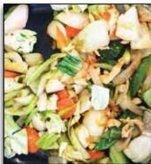
The colorful stir-fry served at the Community Education Dinner in March.