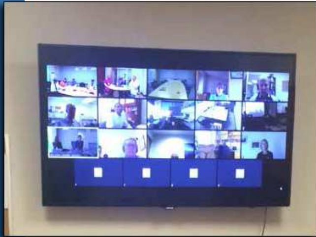
Providers from different sites participating in the telemedicine conference.

Every Tuesday from 11:45 a.m. to 1:15 p.m., Summit Pacific internal medicine providers participate in the University of Washington's (UW) hepatitis C telehealth conference along with approximately 25 other telemedicine participating sites, the closest one being in Aberdeen.