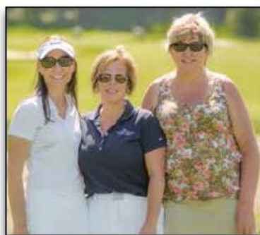
Employee volunteers on the course

Summit Pacific Medical Foundation's annual Celebrity Golf Tournament has commenced! More than 25 teams competed for first place which went to the self-named "Commission Senior Team." However, the real winners are all members of the community who will benefit from Summit Pacific Medical Foundation's Greatest Need Fund.