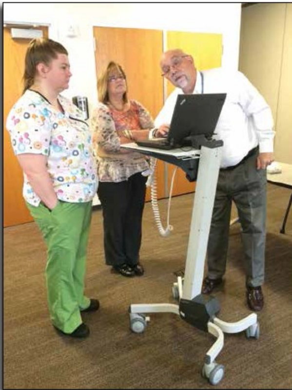
SPMC employees going through interpreter training.

knowledge is something that everyone needs. Other ways of providing interpreter services are over the phone or by in person visits. These methods both lack something. You lose all non-verbal communication when only using audio to communicate. And the availability of an in-person interpreter may not always be when they are most needed.