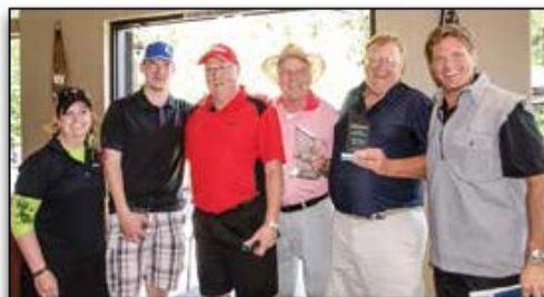
1st place went to the Commission Senior team