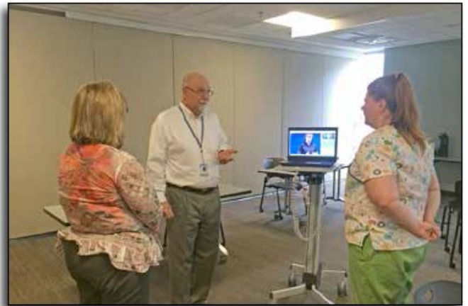
An interpreter translating in American Sign Language during training.