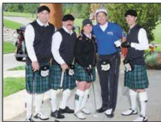
The 2017 Best Dressed Team

This year's proceeds will be designated to benefit the development of the new wellness center. SPMC will be breaking ground on the new facility later this year. The wellness center will be designed to become the community hub for all things health and wellness. At its core is the