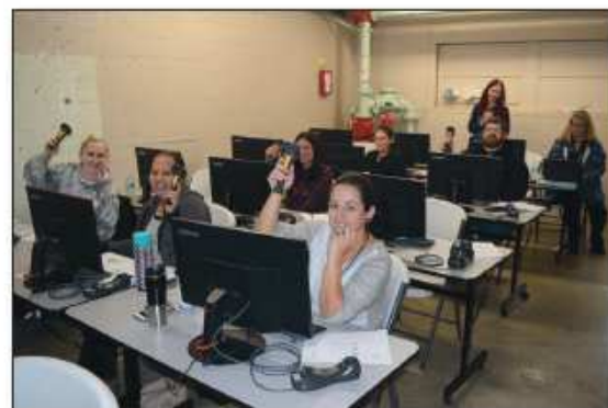
Acute Care Staff training in one of the three Mark Reed training rooms that were prepared for the implementation

We truly appreciate your patience with us as we make this transition. If you have any questions about the implementation of our new EHR, please do not hesitate to contact us. For more information, we invite you to visit a list of frequently asked questions that is available on our website at www.sp-mc.org .