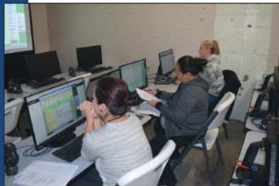
All training is done on computers in the actual software that employees will be using beginning on January 1st

We are excited to announce that on January 1 we will be implementing a new electronic health record, or EHR, across all of our clinics and hospital departments. The most basic definition of an EHR is a digital version of a patient's complete medical record to include medical history, diagnoses, medications, treatment plans, immunization dates, allergies, radiology images and laboratory test results.