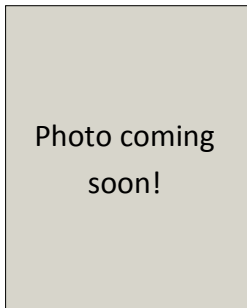
Amy Heckler, DNP, PMHNP